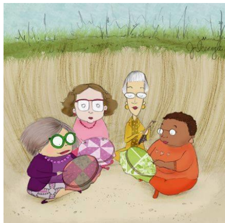
Stich in the Ditch Club

We encourage our guild members to please support the businesses and individuals who so generously support us!